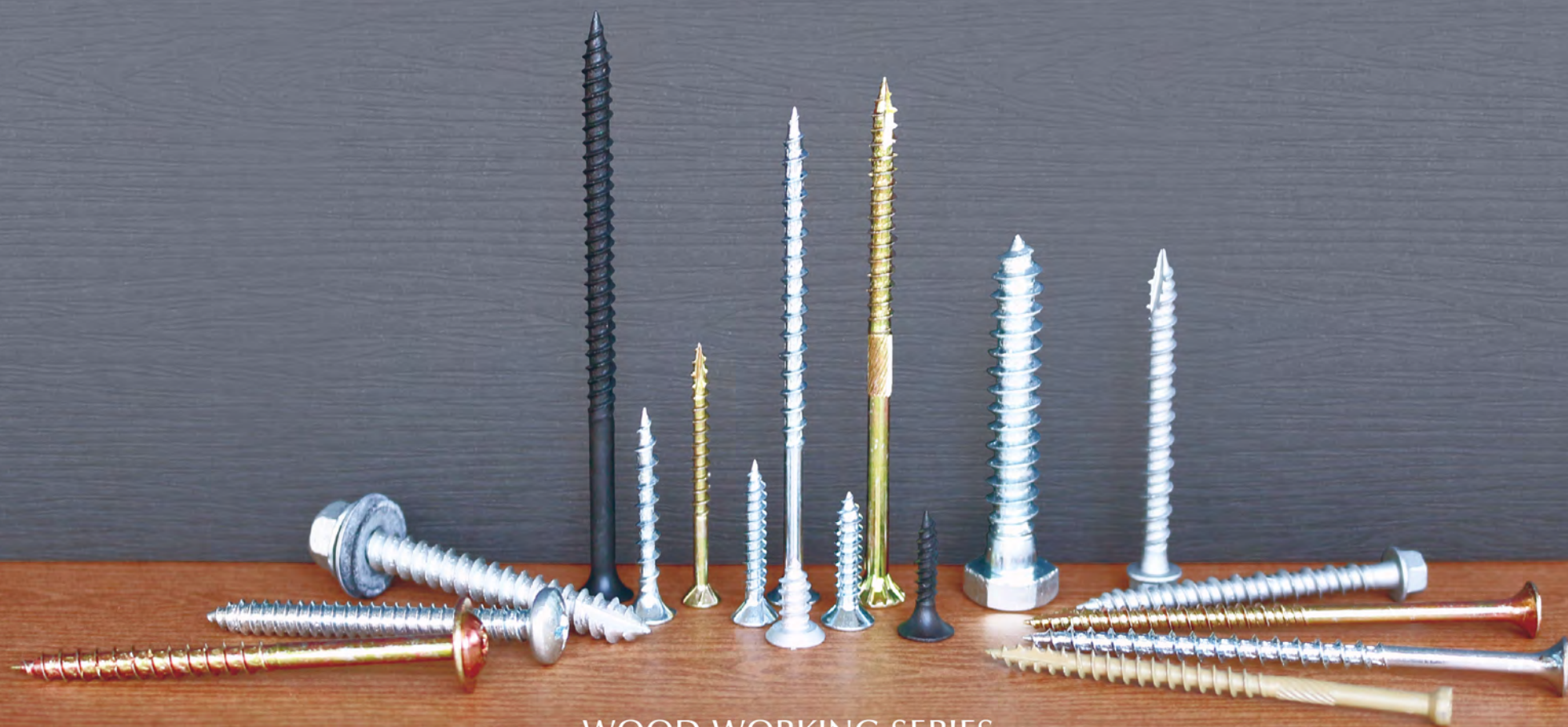
WOOD WORKING SERIES