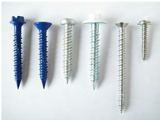
| Concrete Screws | コンクリートねじ