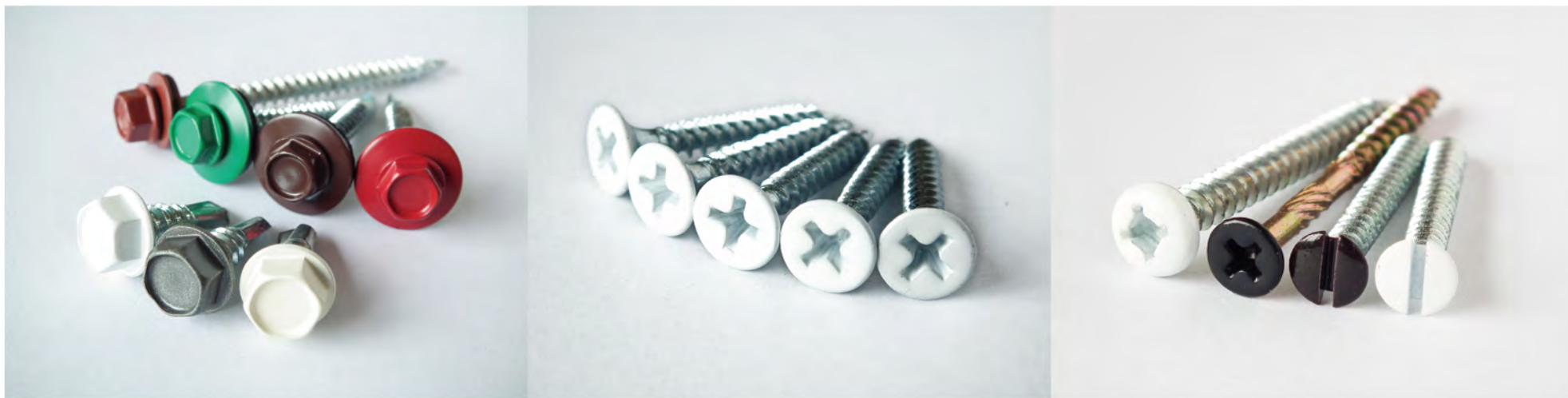
| Head Painting | 頭部塗装