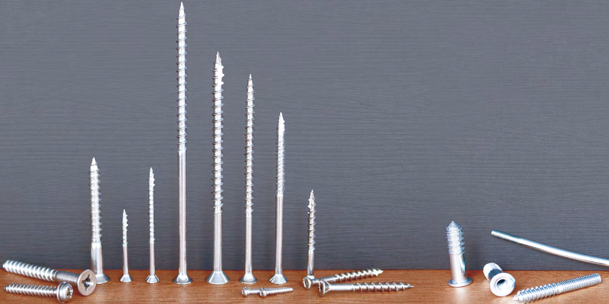
STAINLESS STEEL SERIES