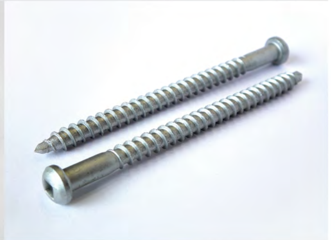
Self-Drilling Screw ドリルねじ