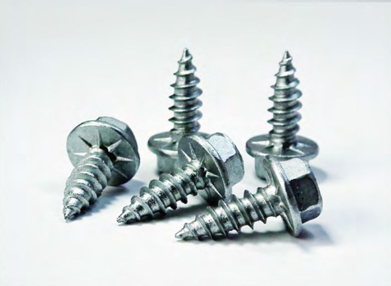
| Self-Tapping Screw | タッピングねじ