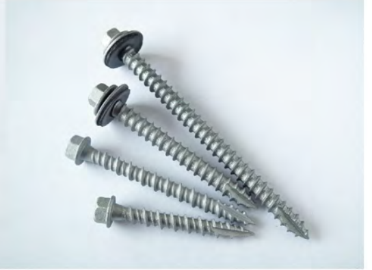
| Wood Working Screw | 建築木工ねじ