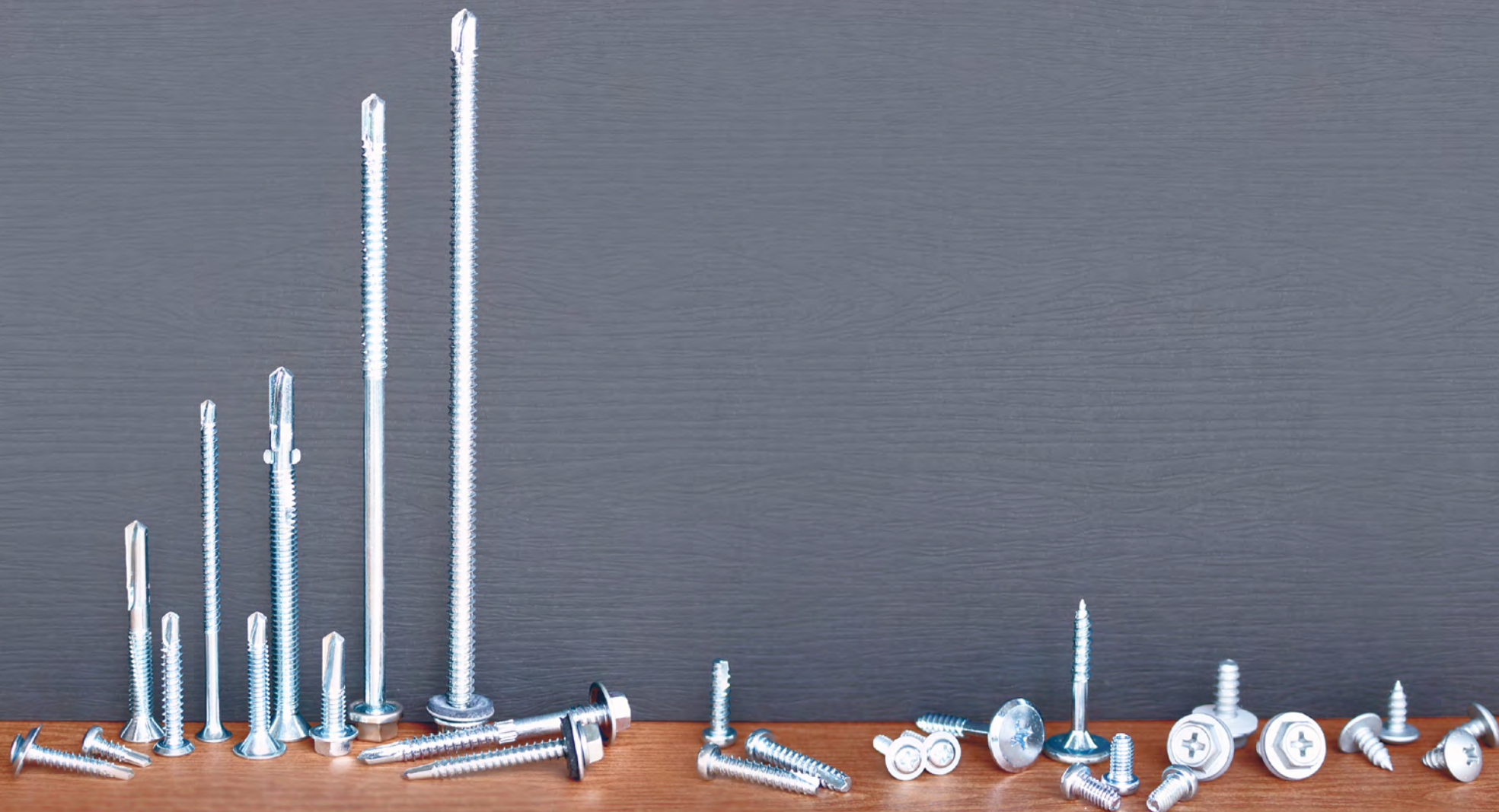
SELF-DRILLING SCREW SERIES