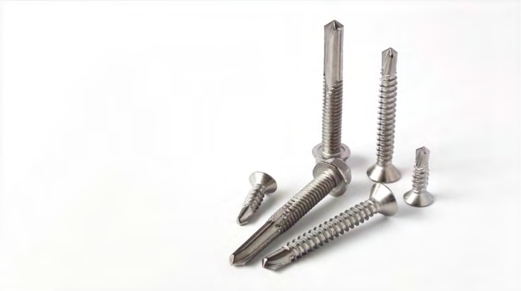
Stainless Steel Screw ステンレスねじ